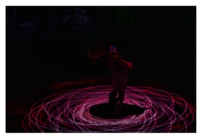
Private and Confidential